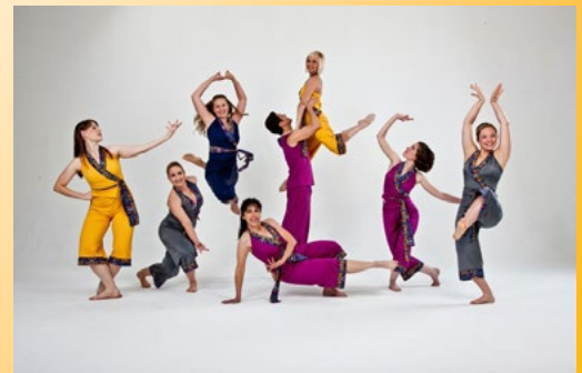
Movement Source Dance Co

EPIK Dance Co , Friday 1 pm, West Courtyard