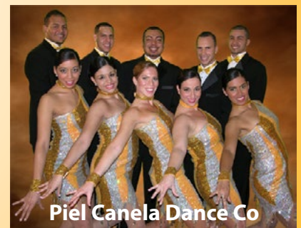
Piel Canela Dance Co