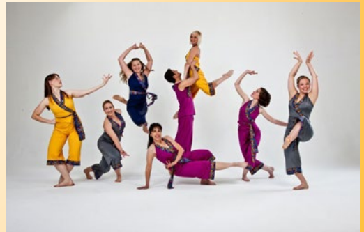
Movement Source Dance Co

EPIK Dance Co , Friday 1 pm, West Courtyard