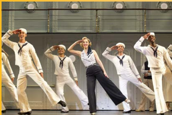
Rachel York and Company