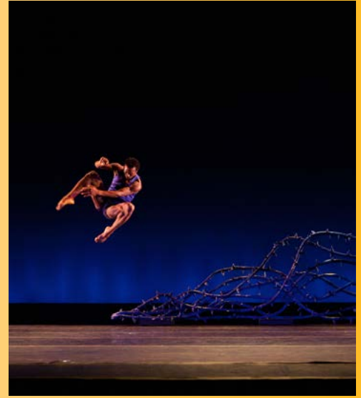
Lighthouse/Lightning Rod

Tickets $39, $49 and $69 online or (480) 499-TKTS (8587).