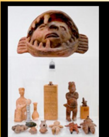
Greek art from the Classical Period Pre-Columbian art from Mexico and Peru