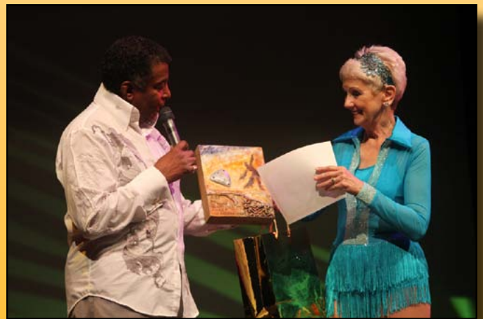
Photos from the tap festival can be viewed on this website as well.

Nian currently teaches at WestBrook Village, Tempe Dance Academy and choreographs for private students in Tucson and the valley.