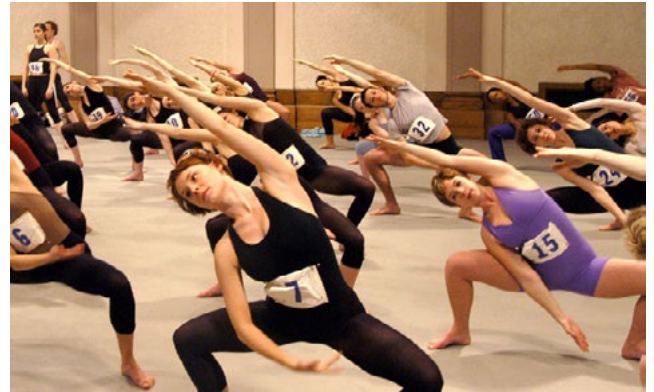
Jacob's Pillow Dance Photo by E Gunter at NY Auditions

Dance.net ~ http://www.dance.net/danceauditions.html DancePlug.com ~ http://www.danceplug.com/insidertips/auditions StageDoorAccess.com ~ http://www.stagedooraccess.com/ DanceNYC ~ http://www.dancenyc.org/resources/auditions.php BackStageDance.com ~ http://www.backstage.com/bso/dance/index.jsp SeeDance.com ~ http://www.seedance.com