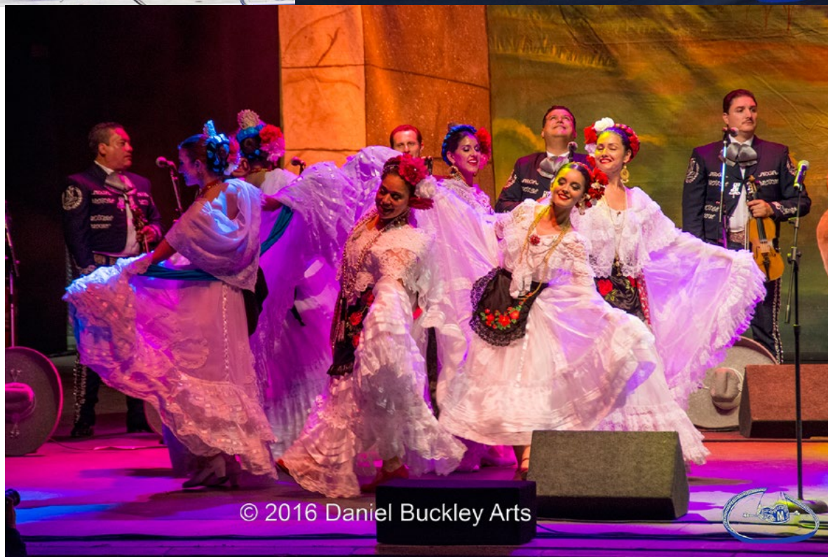
Top row and previous page: Compañía de Danza Folklórico Arizona 2nd row: Sunnyside High School's Los Diablos Azules Bottom: TIMC Masters Folklórico students with Mariachi Nuevo Tecalitán.