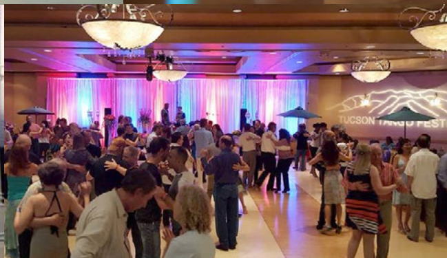
Tucson Tango Festival 2016