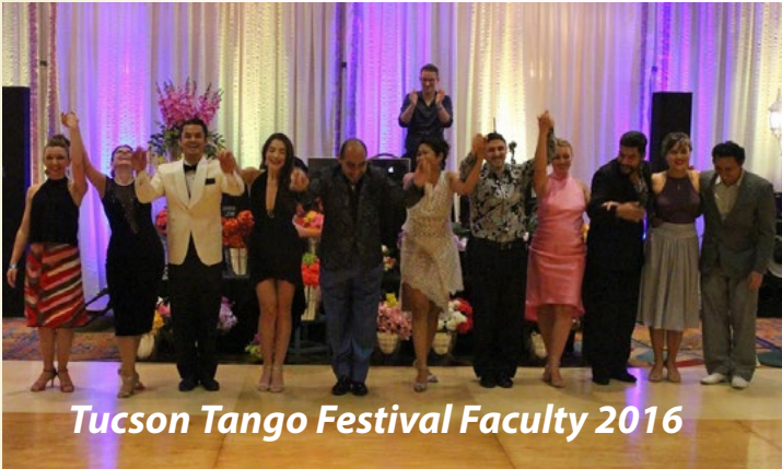
Tucson Tango Festival Faculty 2016

The Tucson Tango Festival drew participants from 29 states, including everyone along the East coast. The biggest group outside of Arizona was California with 44. Next New Mexico with 17, Texas 15, Colorado 14. Four other countries also were represented: Canada, Mexico, Germany and New Zealand. Based on hotels, registration and food and beverage purchases at the hotel, the estimated economic impact was $340,000. The fest was held at the University Marriott, Tucson.