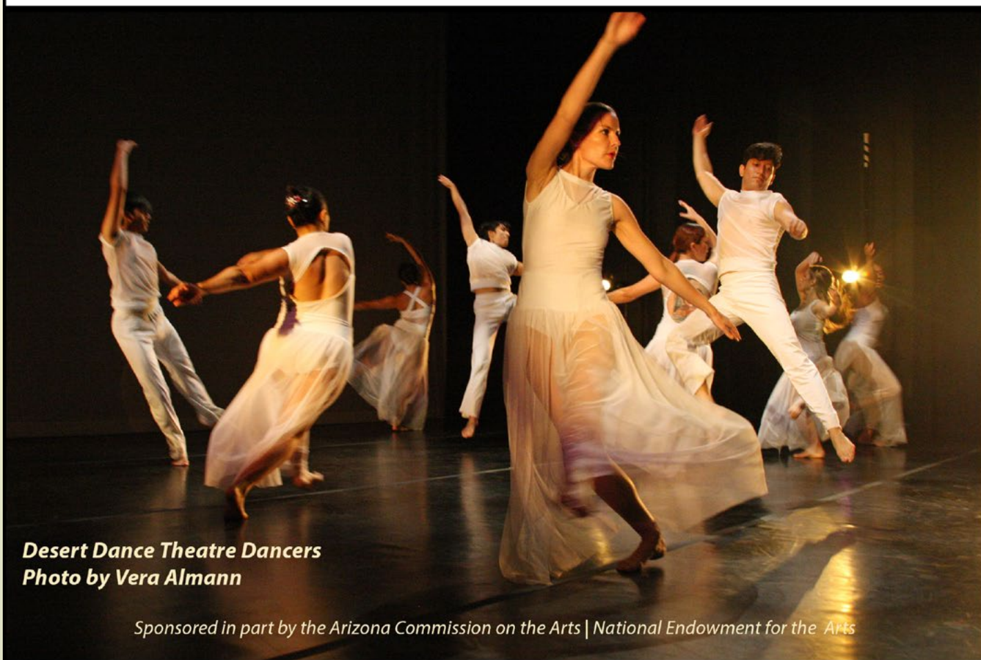
Desert Dance Theatre Dancers

For concert information contact Desert Dance Theatre, 480-962-4584 or go to http://desertdancetheatre.org/arizona-dance-festival/ Tickets $20, $18 senior, $15 student, $13 group & more: TCA Box Office 480-350-2822 or www.tempe.gov/tca