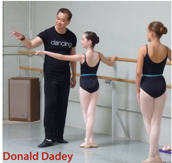
Donald Dadey Scottsdale S/B Auditions

Dance.net ~ http://www.dance.net/danceauditions.html DancePlug.com ~ http://www.danceplug.com/insidertips/auditions StageDoorAccess.com ~ http://www.stagedooraccess.com/ DanceNYC ~ http://www.dancenyc.org/resources/auditions.php BackStageDance.com ~ http://www.backstage.com/bsa/dance/index.jsp SeeDance.com ~ http://www.seedance.com