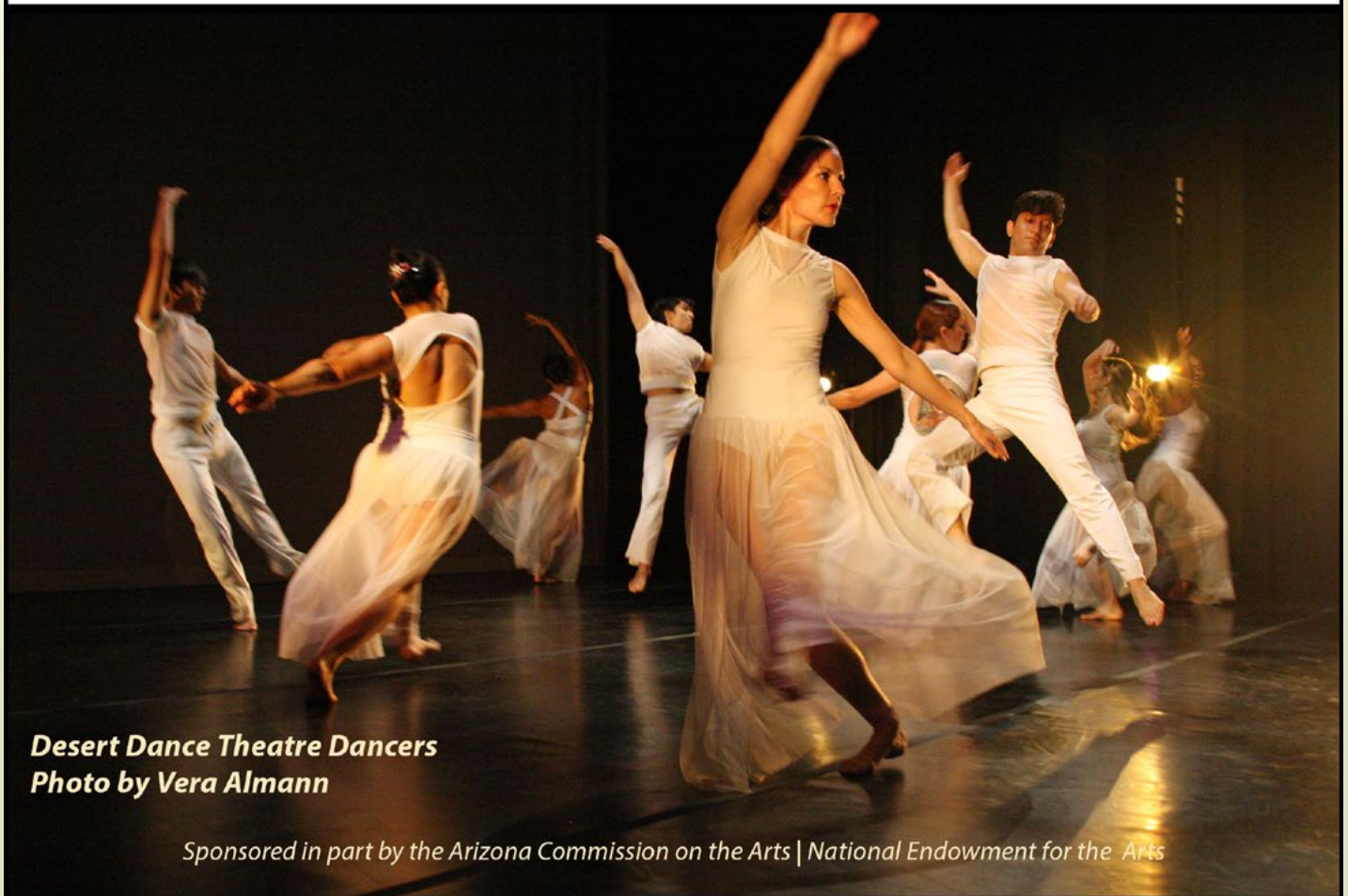
Desert Dance Theatre Dancers

For concert information contact Desert Dance Theatre, 480-962-4584 or go to http://desertdancetheatre.org/arizona-dance-festival/ Tickets $20, $18 senior, $15 student, $13 group & more: TCA Box Office 480-350-2822 or www.tempe.gov/tca